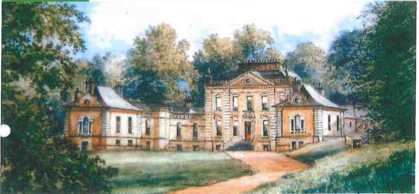
First known watercolour of Mavisbank House