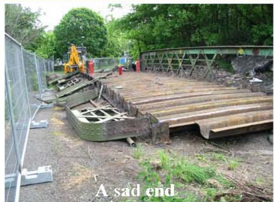
A sad end