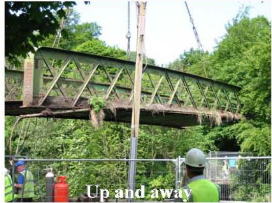
Up and away