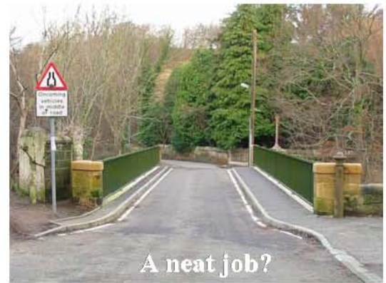
A neat job?

On the whole, opinion of the new bridge is favourable, but why such a heavy structure on this narrow road? Why the white lines and large sign? And why the "urban" style stonework? But we're pleased the old post survived. Some people like the green railings, some don't. You can't please everyone!