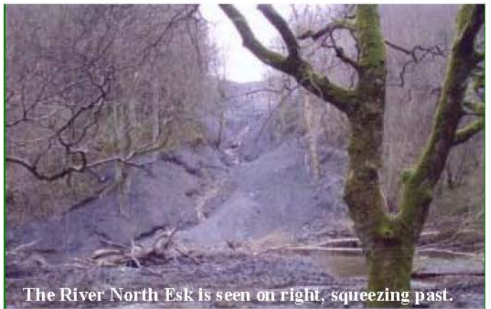
The River North Esk is seen on right, squeezing past.

On 12th January, a member took the photo on the left, of the river as it passed through Polton Village. It was thick, grey and flowing fast. For eight hours it remained this weird colour and consistency as it passed, under the new Polton Bridge on its way to the sea at Musselburgh.