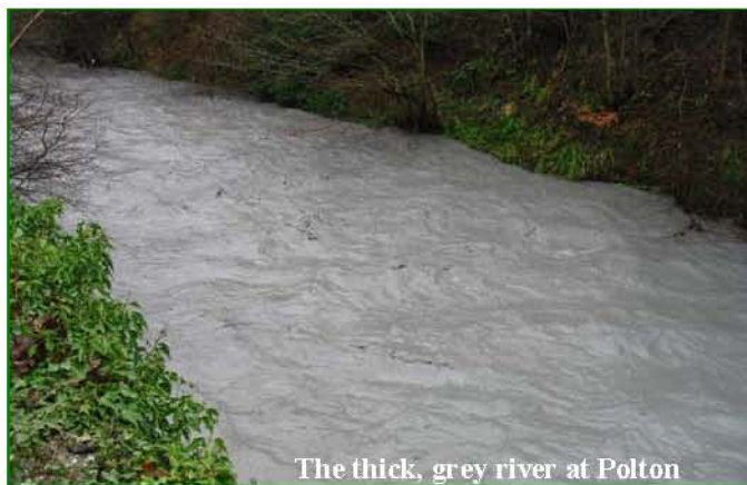
The thick, grey river at Polton