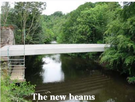
The new beams