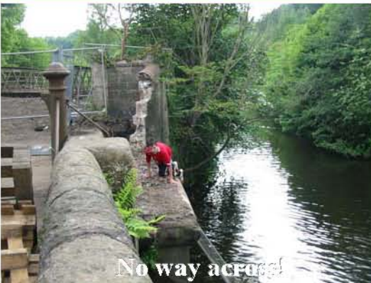
No way across!