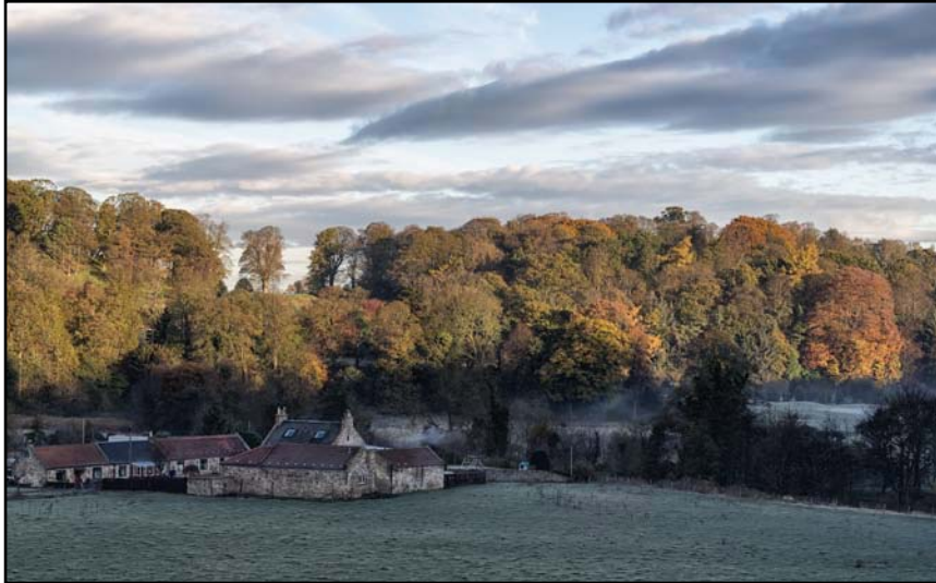
Middle Mills, Lasswade from Elm Row