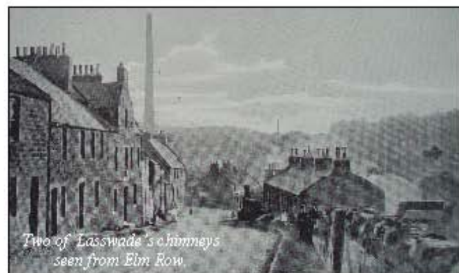
Two of Lasswade's chimneys seen from Elm Row.